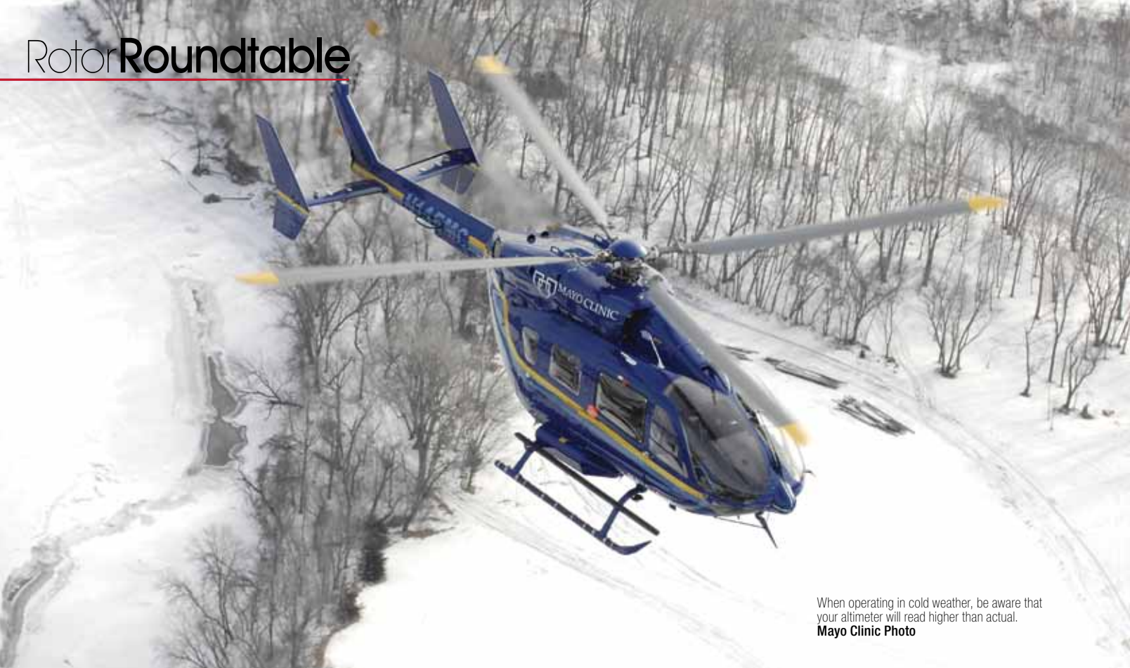
When operating in cold weather, be aware that your altimeter will read higher than actual.